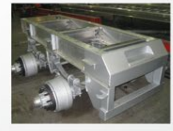
Galvanized Steel subframe