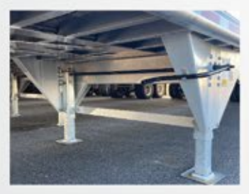
• JOST Galvanized Framing with 10 year warranty. Reverse Mount Dolly Legs for stability and distributing load evenly in bottom rail.

• Keith Walking Floor/Aluminum Drive Frame with 2 year warranty