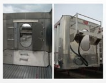
Radius Design Bulkhead for improved aerodynamics and the MAC Man Door provides safe and easy access into the trailer from the bulkhead.